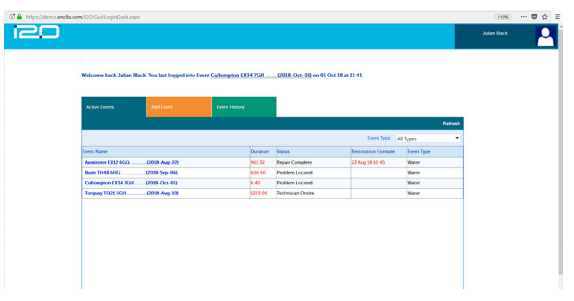
Active events (dashboard)